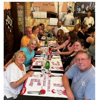
Half the Group!