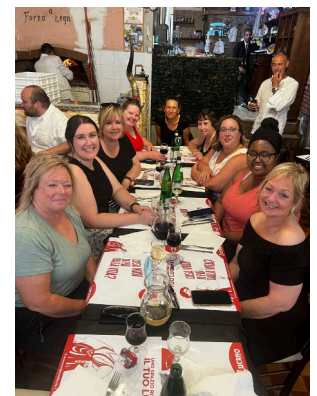
The other half of the group!