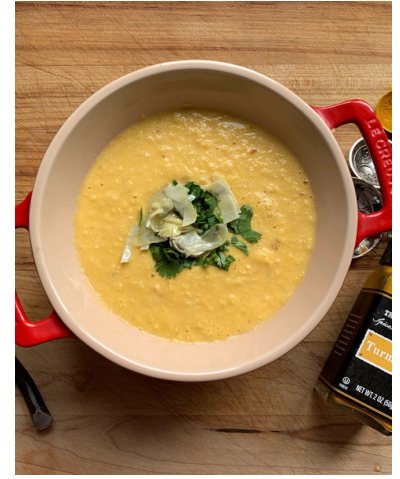
Delicata Squash Mac N Cheese