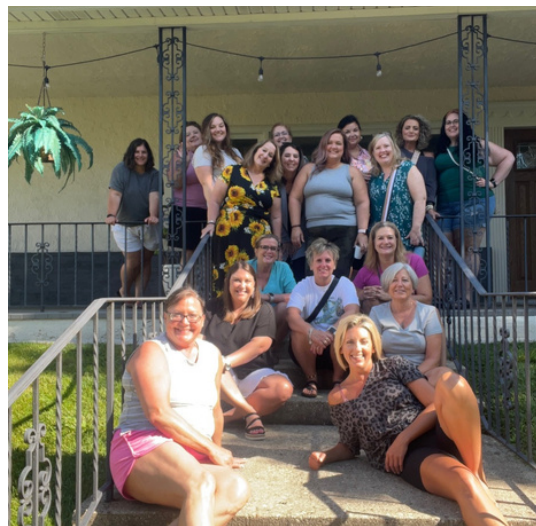
Living for Today!

This time of year it's easy to give up as we go into the holiday season and decide to try again January 2023. But just think how much you can accomplish in four short months!