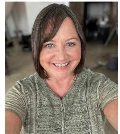
Professional Hair and Makeup!