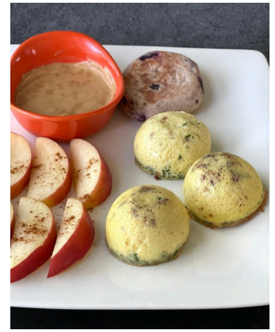
Egg bites - so good!

If you count calories or macros, each one is 60 calories, 4.3 fat, .6 carbs, .1 fiber and 4.8 protein. On my WW plan, each one is 1 WW point.