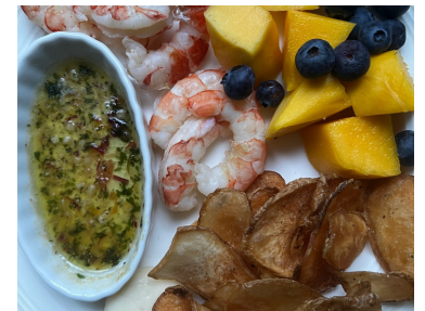
Perfect Shrimp Cocktail