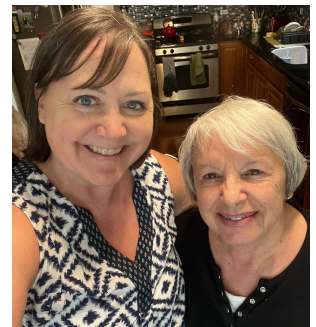
Momma and Me