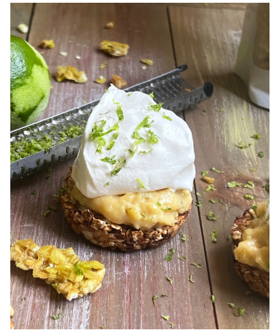
Key Lime Pie Bites